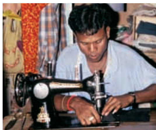
New machines lead to improved livelihoods